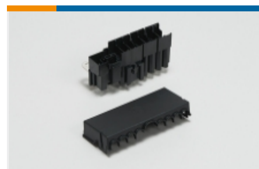
Battery Distribution Units(6)