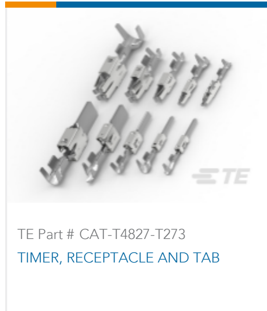
TE Part # CAT-T4827-T273 TIMER, RECEPTACLE AND TAB