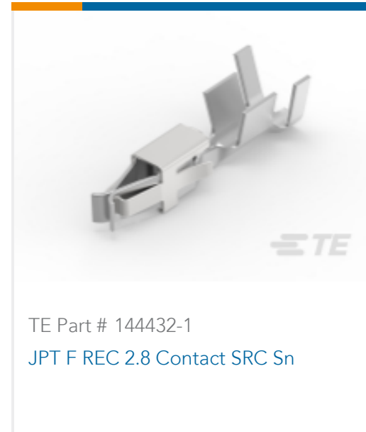
TE Part # 144432-1 JPT F REC 2.8 Contact SRC Sn