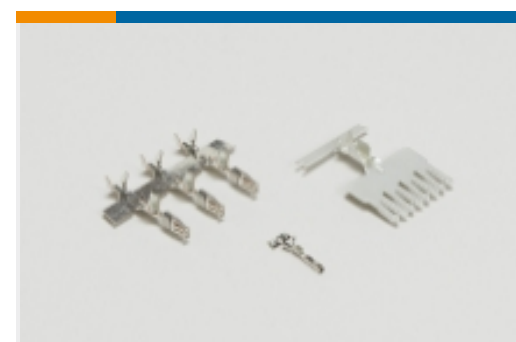
Busbars & Terminals(5)