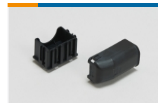
Hard Wired Box Accessories(11)