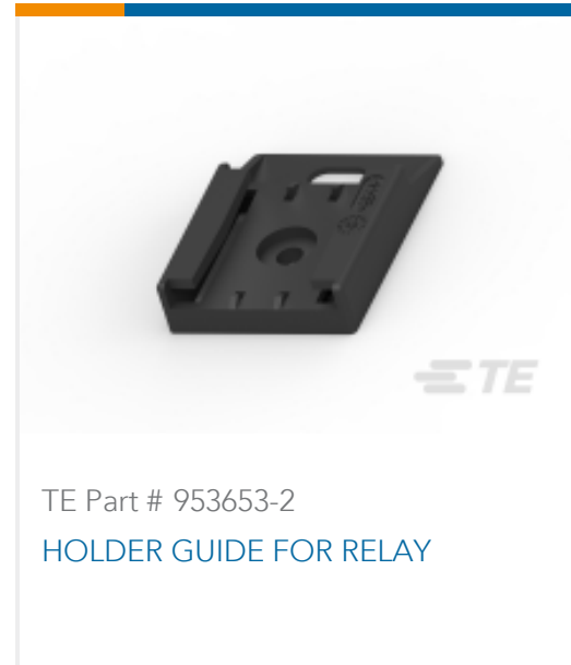
TE Part # 953653-2 HOLDER GUIDE FOR RELAY