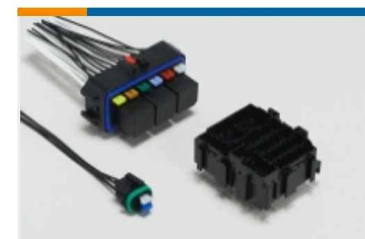
Other Hard Wired Boxes(6)